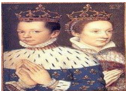
Mary and Francis II