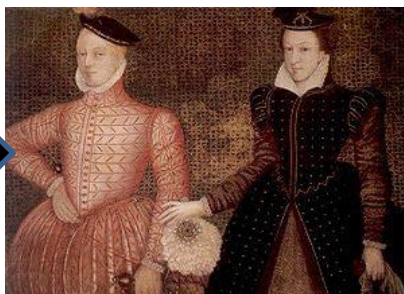
Mary & Lord Darnley