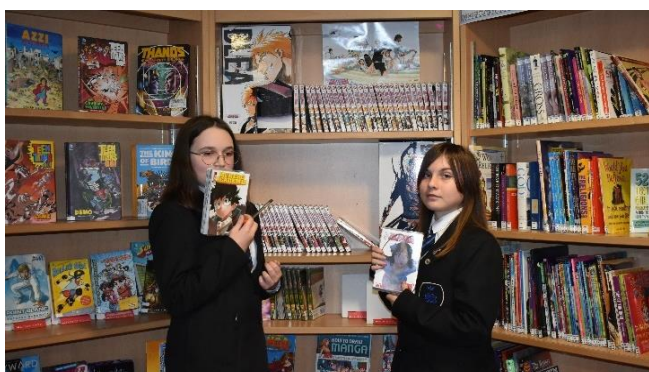
Growing our Manga collection: