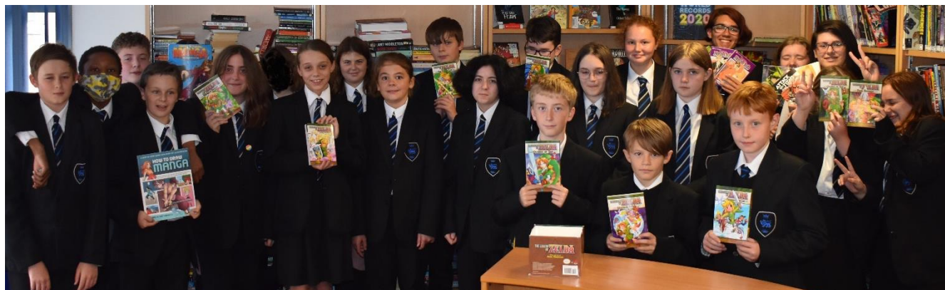
Over 30 Students regularly join in our Manga Club!

News: In October we celebrated Black History Month and we received the wonderful news that we were one of the lucky schools, out of 1600 applicants, who would be receiving 135 books by authors of colour. Penguin Books donated these so that our library and literature can reflect the rich diversity of today's society. The bundle included five copies of the hardback edition of Barack Obama's autobiography worth £35 each!